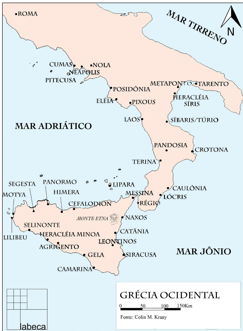
Fig. 01: Sicily in Western Greece