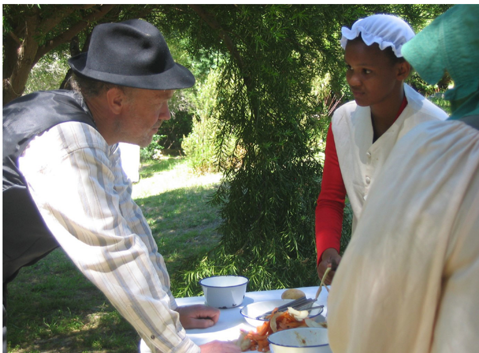
Figure 4: The Time Travel events create safe spaces to reflect and talk on the key questions while working with the hands. A Time Travel event to 1853 in South Africa.

The Time Travel event is a drama with a considered dramaturgy, in order to increase the learning and reflection process.