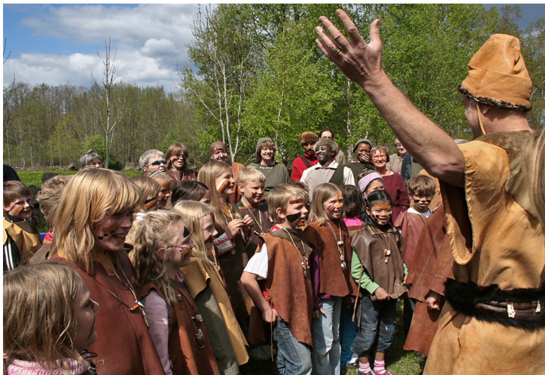
Figure 2: The first Time Travel site, close to Kalmar, Sweden. This Stone Age site has been used for Time Travel events from 1986 and onwards. The picture is from 2006, grade three learners at the neighboring school.

In the 1990s, this learning concept was made available also to adults, organizations and institutions. Kalmar County Museum organized many training days for teachers and community members. Up to 100 Time Travel events per year including big public historical events were held. The local sites, which were always close to the schools, spanned time periods from the Stone Age to the 20th century.