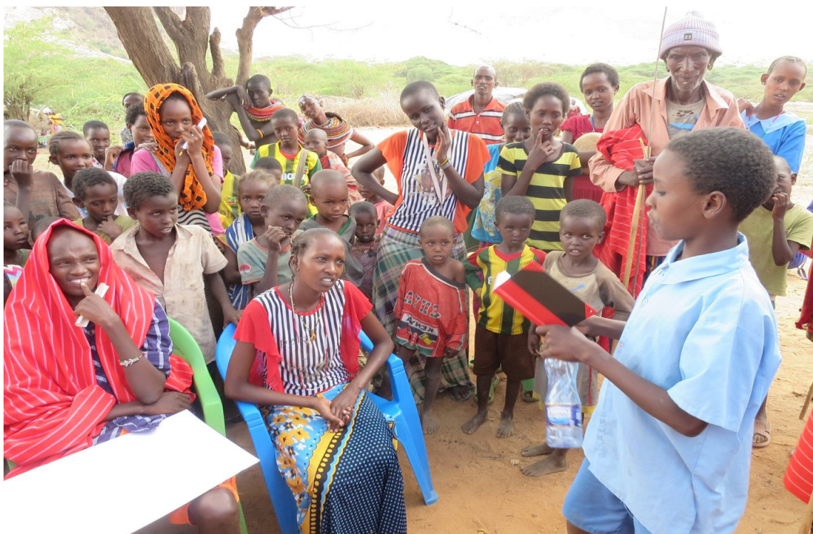
Figure 8: Traditions to keep, traditions to leave. A young boy giving his opinion, while men and women, elders and youngsters are listening. Time Travel event in Ngurunit, Kenya.

There were preparations in school and in the community, research, interviews, and the scenario was developed. Finally, a pilot Time Travel event was held, with a mixed group of learners from a local school and community members. In total circa 50 people participated. The fictional story was a gathering for a girl and a boy leaving for university in Nairobi. There were mathematical activities, for example building a hut, making a necklace, sports, and games, drawing of the manyatta and intensive discussions on the key questions, which traditions to leave and which traditions to keep. Finally, the groups delivered their suggestions to the girl and the boy. The various ideas on traditions to keep or leave created a lot of emotions and talks continued. As this was a fictional event, most people dared to speak their mind, also children and women. (Figure 8)