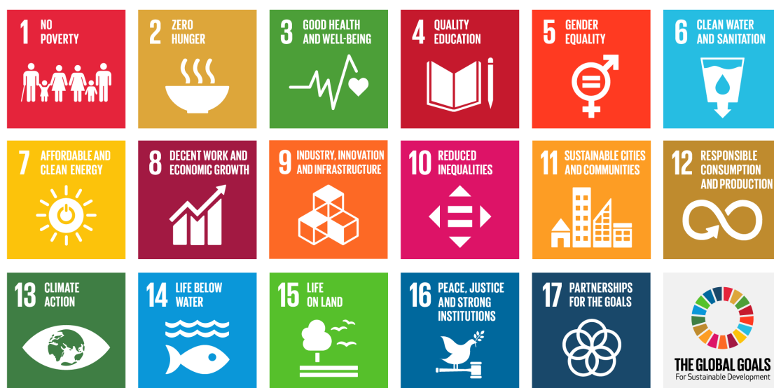
Figure 1: The 17 Global Goals for Sustainable Development.