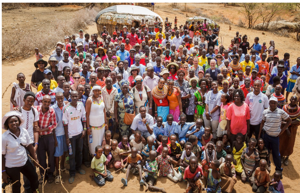
Figure 9: Bridging Ages international conference in Ngurunit, Kenya 2014. 150 people from all over the world in a manyatta.

After the first Time Travel program in 2011, the community decided to form a local CBO called Bridging Ages Northern Kenya (BANK), to continue and develop the program. The CBO faced some challenges the years after. Ngurunit is situated in a food insecure area, quite often experiencing draughts, causing huge challenges for people and livestock. But the Time Travel programs have continued, including research of the history and heritage of the Samburu. The biggest achievement, so far, was when BANK hosted the Bridging Ages international conference 2014 in Ngurunit, “Education, Heritage and Community Building”. 150 persons from all around the world, including quite many people from central Kenya, came to Ngurunit and stayed for five days, discussing local, national, and global issues and experienced the hospitality of the Samburu. Making this conference a success gave a lot of confidence to the community members and connected Ngurunit to the world. (Figure 9)