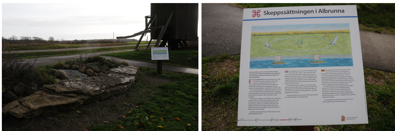
Figure 9. Display of the shattered original, together with a signpost, at the adjacent parking lot. The concrete copy is visible in the background.

A couple of years later, I interviewed some of the villagers asking them what they felt about this whole affair. While the concrete copy was clearly appreciated and regarded “the best we could get”, not all of the informants were altogether happy with it. While the shape and the surface structure of the copy indeed resemble the original in detail, its material and color does not and the general impression is that it looks new, homogeneously grey and lacking the patina of the withered original. It seems something of the age value of the monument was lost in the process. “When the Yellow Wagtail rests upon it, it feels OK, but otherwise is just stands there, lifeless”, one of the informants explained. The term “lifeless” is interesting in this context; apparently, this informant experienced that the original stone had a quality of life, while the copy didn’t. But when the familiar bird rested on the copy like it used to do on the original, something of this life was temporarily brought back. Hence, the sense of aura rested not only in the original stone itself but in the perception of its setting, the physical environment surrounding it and even a bird commonly seen resting on it. This connects to Holtorf’s concept of “Pastness”, which is something that can be reproduced if we only know what buttons to push (HOLTORF, 2017). I guess none of us would have thought of the bird, though.