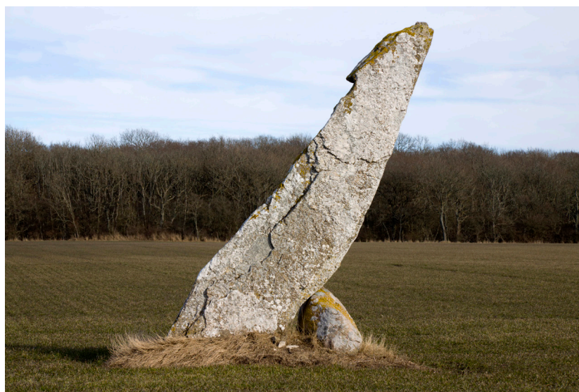
Figure 2. The 4 m tall Albrunna stone, as it appeared in 2013.

At Albrunna, a particular ancient monument has caught the attention of travelers for centuries. For most of the 20 th century, the Albrunna stone was visible as a 1 m wide and 4 m high standing limestone slab located just south of the village, oriented N–E and tilting to the south, leaning on a large boulder as to create an unmistakable shape of a giant erected phallos (fig. 2). The shape of the stone itself contributed to the vulgar impression, and the location of the monument just next to the main road probably made many travelers both laugh and gasp. Archaeologically, the stone would normally be interpreted as an Iron Age burial monument (c. 500 BC – AD 1050). Early depictions, however, indicate that the stone is in fact part of a larger monument, i.e. the stern stone of a large ship-shaped stone setting, typically from the Bronze age or the Iron Age (PAPMEHL-DUFAY e GOLDHAHN, 2018: 13ff) (fig. 3). In fact, one of the elderly people in the village gave an account of how he, as a 7-year old child in the late 1930s, witnessed the removal by farmers of the ship’s northern stern stone (PAPMEHL-DUFAY e GOLDHAHN, 2018: 51).