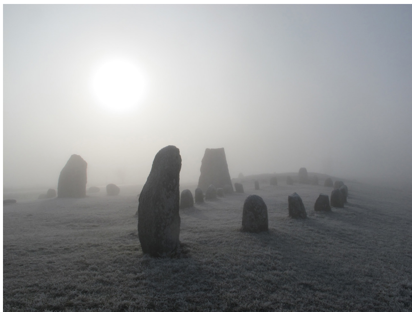
Figure 7. Ship-shaped stone setting at Gettlinge, SW Öland, about 8 km to the north of Albrunna.

In this way, the brief but intensive archaeological excavation turned the Albrunna stone into the Albrunna ship, placing it alongside about 40 known monuments of this type on the island (fig. 7) (PAPMEHL-DUFAY e GOLDHAHN, 2018: 69ff). Ship-shaped stone settings in Scandinavia typically date to either the Bronze Age (c. 1700–500 BC) or the late Iron Age (around AD 500–1000) (SKOGLUND 2008; WEHLIN, 2013). They range in size from just a couple of meters up to c. 50 m or more in length (ARTELIUS et al. 1994:19ff). The longest known stone ship in Sweden is Ales stenar in Askeberga, Skåne, measuring 67 m in length (ANDERSSON et al., 2013). In Jelling, Denmark, a stone ship c. 170 m in length has been recorded, by far the largest ever known (RANDSBORG, 2008). The stone ships sometimes contain the cremated remains of one or more individuals, but in other cases no such remains are found and their presence at cemeteries could also be understood in terms of their inherent symbolism expressing themes connected to journeys, travelling and reproduction.