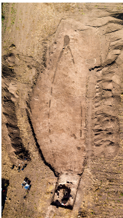
Figure 6. The contours of the stone ship as it appeared after the top soil had been removed. The remains of the Albrunna stone are in the lowermost part of the picture.

Initially, the area surrounding the remains of the stone itself was investigated and it was confirmed that the characteristic tilting of the stone in fact was intentional, i.e. it had been placed in a tilting position when it was erected. Thus, the phallic shape most likely was not a chance but an intended expression of the monument by its builders. Just north of the erected stone, oblique marks could be seen from removed stone slabs possibly indicating the rails of a ship-shape extending to the north. Therefore, the second week of the excavation was spent on removing the topsoil and investigating the area to the north of the Albrunna stone. Here, clear traces of a ship-shaped stone setting appeared, c. 26 m in length in total, with the tall phallic Albrunna stone having marked the southern stern (fig. 6). The marks of the rail-stones were clearly visible, and in the northern part several rail-stones were still partly present. The foundation pit for the northern stern stone was filled with limestone fragments, probably a result of it having been blown into pieces in the 1930s. The elderly man in the village, who told us of how he as a child witnessed the removal of the northern stone, accompanied us during the removal of the top soil. He was delighted when we could confirm that there in fact had been a northern stone. That it seemed to have been blown to pieces, and not removed by horse-power as he recalled, did not seem to bother him.