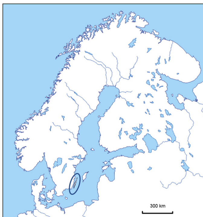
Figure 1. Map of Scandinavia, with the island of Öland indicated (circle).

In areas with an abundance of standing stones and other prehistoric monuments, a character or “aura” of age, authenticity and uniqueness often strongly influences the way the landscape is perceived and appreciated today. An example of this is the island of Öland, located in the Baltic Sea outside the mainland coast of SE Sweden (PAPMEHL-DUFAY, 2006: 65ff) (fig. 1). Like its distant neighbor Gotland to the east, Öland consist of limestone providing an extremely flat landscape in sharp contrast to the mainland coast. Owing to its unique natural conditions, Öland has been a focus of interest for people of many disciplines and professions. Nowadays the island is a popular summer home for thousands of Swedish and foreign tourists and it has a substantial number of artists living there all year round, attracted by the fascinating and unique landscape. Ornithologists and birdwatchers come from far and near each year, and the unique flora and fauna of the Great Alvar is another source of attraction for both scholars and laymen. The southern third of the island was declared a World Heritage Site by UNESCO in year 2000, in recognition of its varied and well-preserved historical agrarian landscape.