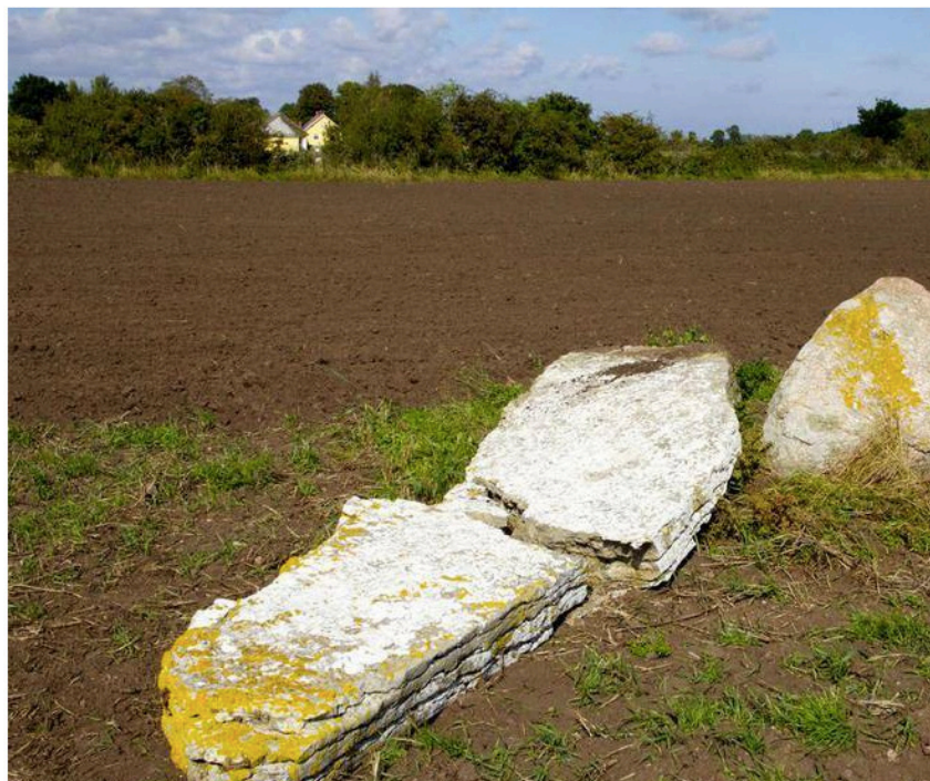
Figure 5. The news of the shattered Albrunna stone hit Öland in the autumn of 2014. From the local newspaper Barometern , Sept. 17 th , 2014.

The accident evoked strong emotions locally, resulting in numerous phone calls to the regional antiquarian authorities demanding the stone to be repaired and re-erected. The immediate response was “yes”, but it soon turned out more difficult than first envisioned due to the poor condition of the remaining fragments. Thus, the sad remnants of the once proud monument were left lying as they fell for almost two years, leaving a flat and empty space. Local voices however were not happy with this, and the authorities were repeatedly and intensively urged to make the stone standing again. “We felt that we’ve been deprived of something”, one of the villagers later explained. Apparently, the ancient vulgar silhouette had become an important part of the local identity and when it fell, the village not only lost its “skyline” but a part of its identity. A wound was cut opened in the local community, that seemingly could only be healed if the stone was re-erected.