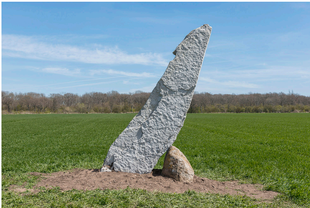
Figure 8. The newly uncovered Albrunna concrete stone, May 2017.

Shortly after the excavation at Albrunna was finished, the efforts of creating a concrete copy of the stone started. For several months, two stone conservators were occupied with taking a silicon cast of the original fragments and using it to cast a 6 m long concrete replica (including the part that was to be underground) to be erected at the site. The cast was made one-sided, so that the side of the slab facing the road would have the exact surface structure of the original, while the side of the slab facing away from the road would be flat. Here, a small metal plaque was inserted, informing the visitor about the monument being a replica as well as a brief account of its production. A large pit was dug at the site of the original stone, leaving the boulder in place on which it has been leaning. The concrete copy was put in place and secured by filling the pit with concrete. On May 12 th 2017, the new Albrunna stone was solemnly uncovered in front of a cheering crowd of local inhabitants and representatives of authorities, archaeologists and local media (fig. 8). All seemed happy with the giant phallos being back in place, order restored. The original fragments were later placed on an adjacent parking lot accompanied by a signpost presenting the history of the monument, including the results from the excavation and the reasons for its reconstruction (fig. 9).