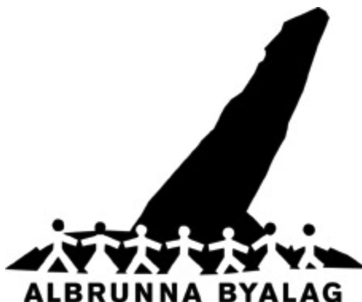
Figure 4. Logotype for the village community of Albrunna.

Stone ship or not, the giant phallos of Albrunna has come to function as a major local landmark, and its silhouette was even used as a graphic symbol for the local village community (fig. 4). Clearly, its peculiar shape rendered the small village some form of fame, with innumerable pictures taken of the stone with people posing in various ways in connection to it. The Albrunna stone played an important role in local place attachment and in creating a sense of common identity for the local community, thus its significance locally adheres to the above-mentioned social value of heritage (JONES, 2017). It was then no less than a small disaster when, in the fall of 2014, the Albrunna stone accidentally fell over and broke into pieces (fig. 5).